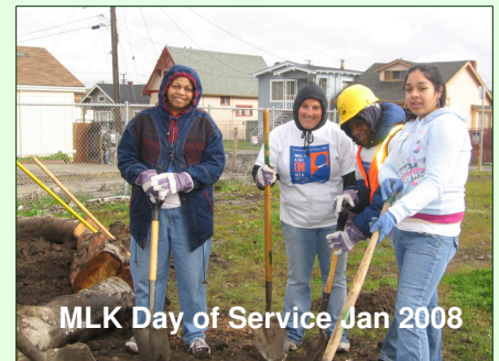
MLK Day of Service Jan 2008